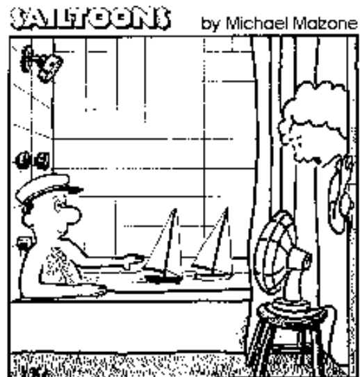
You can come out now... it's Spring!